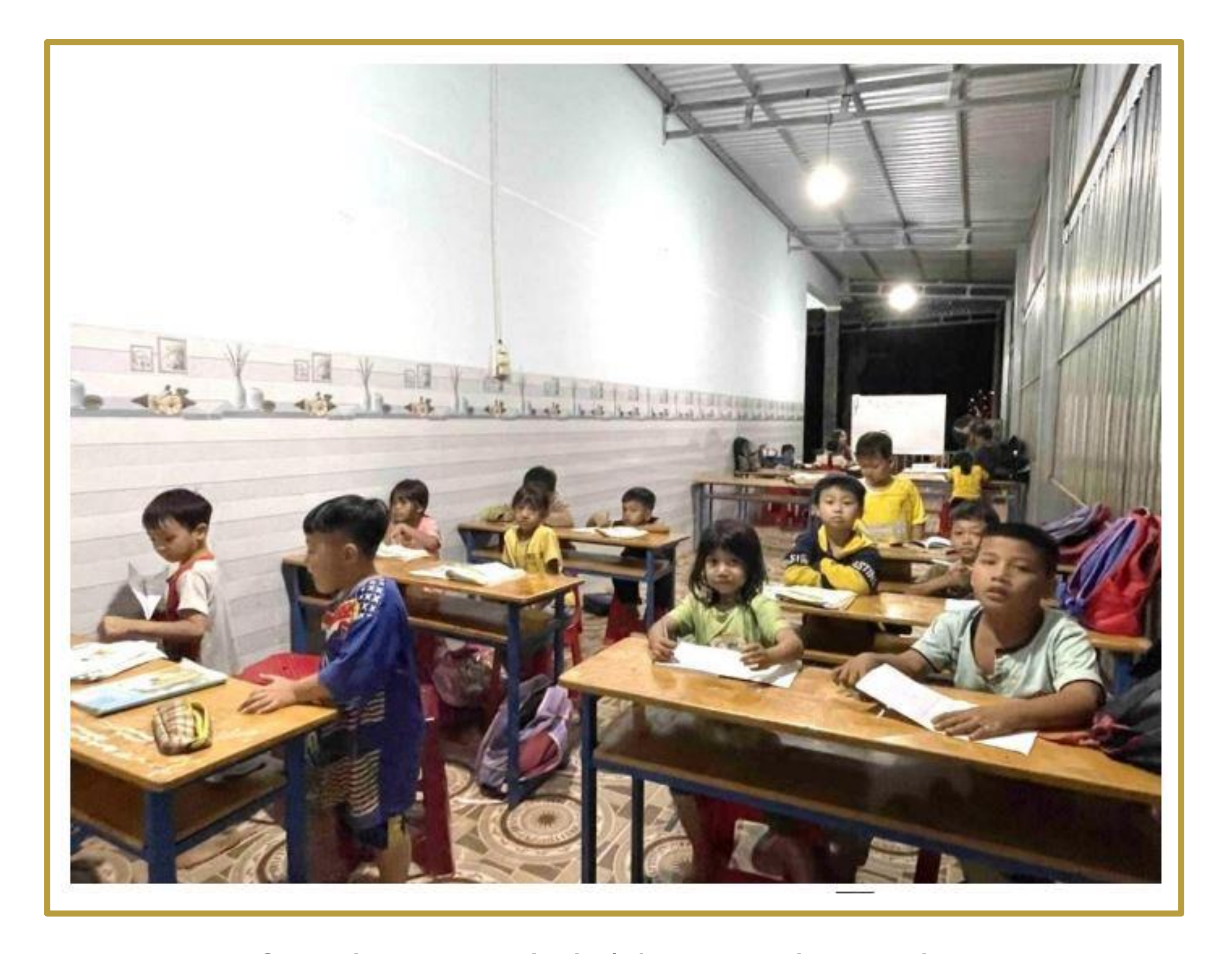
In support of underserved children and at-risk women in Vietnam